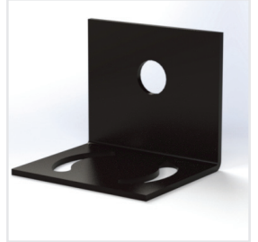
FMB-1 (8.4 mm diam.) Standard Fiber Optic