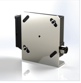
SEB-1 Stainless L Bracket