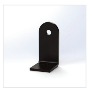
FMB-3 (3.1 mm diam.) Mini Plastic Fiber Optic