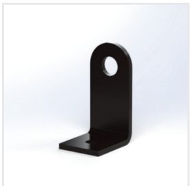
FMB-2 (5.1 mm diam.) Mini Glass Fiber Optic