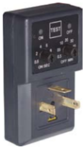
Type : XY-702